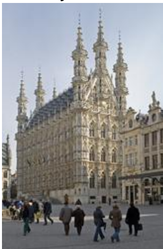
Leuven Town Hall

Welcome to the cosy city of Leuven. Leuven is the capital of the province of Flemish Brabant, one of the 10 provinces of Belgium. Leuven counts ca 100.000 inhabitants and more than 30.000 university students, who study at one of the world's oldest Catholic Universities. The university hospital UZ Leuven is not only Belgium's largest, but also well renowned all over the world.